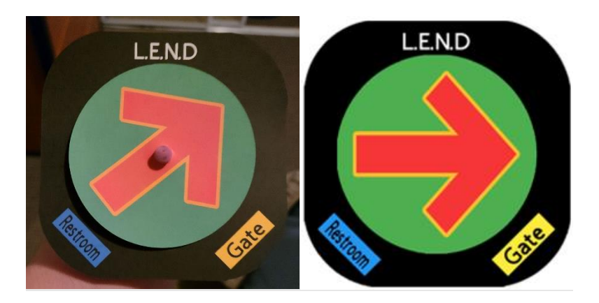
Figure 5: Prototype concept art for the final design of the L.E.N.D.

To simplify the user experience and account for their technological literacy, the team decided that the devices would have two buttons: one for directions to bathroom facilities and one to the passenger's gate. In addition to the buttons, the device was given the name "Low Energy Navigation Device", or L.E.N.D. Overall, feedback from users and experts was widely favorable towards the final rapid prototypes shown below. Multiple stakeholders appreciated the simplicity of the two-button design and the explicit directions of an arrow pointing passengers in the right direction. Additional feedback from an in-person meeting with senior relatives and a 3D printed prototype yielded additional information, such as having buttons for eating establishments or rental car areas. Also, the senior family members appreciated the large text and arrow design of the prototype and were particularly impressed at the simplicity and versatility of the solution.