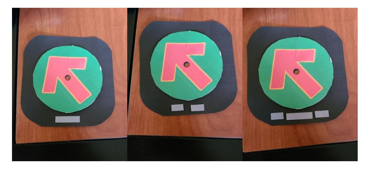
Figure 4: Secondary iterations of the rapid prototype

Figure 3: Initial rapid prototype that the device did not have enough features. The group decided to add buttons to the device, and the corners were rounded to make the device more comfortable to hold. Additionally, the screen would be made green rather than black due to the widespread stakeholder appeal for the contrast provided by the green background. Another design factor to be determined was how many additional buttons and features the device would have during the following steps.