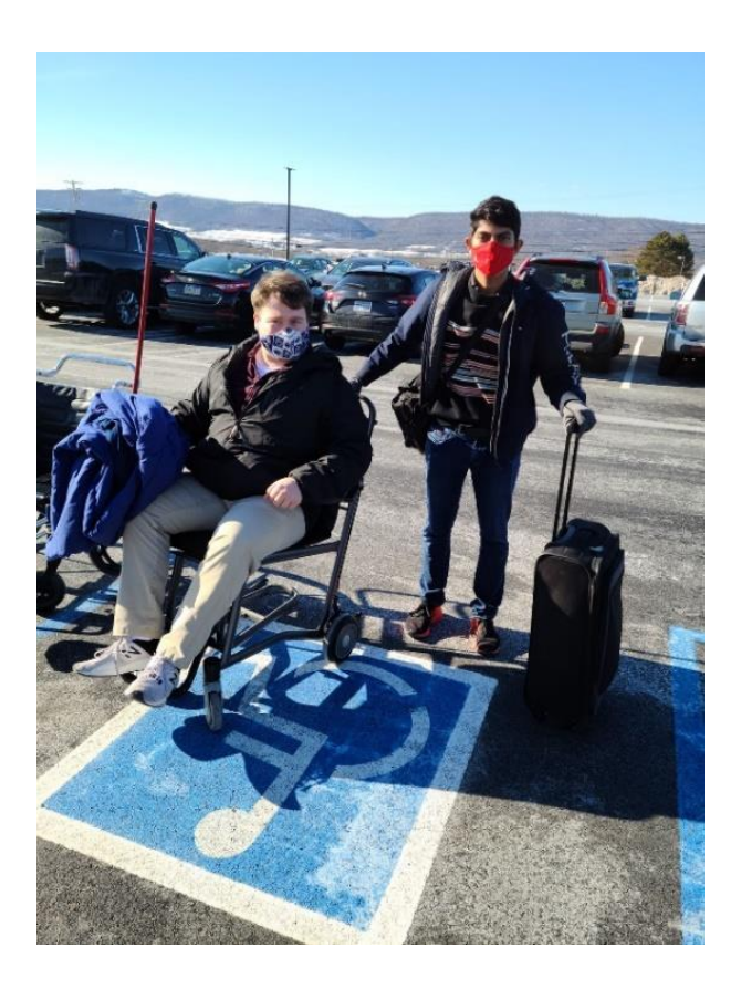
Figure 2: Team members at the University Park Airport conducting the "Walk-a-Mile Immersion" field research project.