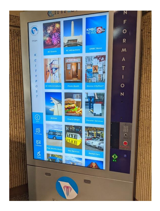
Figure 1: An information kiosk with a complex user interface.