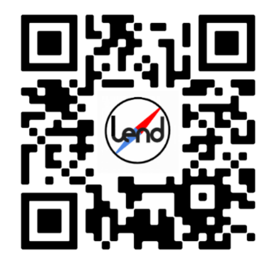
Figure 8: L.E.N.D. Commercial filmed by team members

Using the feedback from multiple rounds of rapid prototyping, the team developed the final prototype of the L.E.N.D. system. Outlined in the functional decomposition above, the L.E.N.D. system incorporates kiosks for passengers to receive L.E.N.D.s, the devices themselves, and Bluetooth Low Energy beacons to enable navigation. Upon arrival at the airport, older passengers will have the opportunity to receive a pre-programmed L.E.N.D. free of charge either from the check-in counter or L.E.N.D. kiosks distributed around the airport. By default, the device will point to a passenger's gate, but using the restroom button will direct the passenger to the nearest bathroom, afterward which the gate button will put them back on their original path. Any gate changes to a passenger's flight will be broadcast to the L.E.N.D., and their path will subsequently be updated to the correct location. Both a C.A.D. model and a 3D printed prototype have been included above in Figure 6. In addition, a commercial demonstrating the L.E.N.D.'s benefits have been included as part of the final prototype and can be accessed in the Q.R. code on the cover page of this report and has also been included below. Not only is the commercial informative and lighthearted, but the specific style of the commercial is modeled from advertisements typically seen on television shows that are popular with older populations.