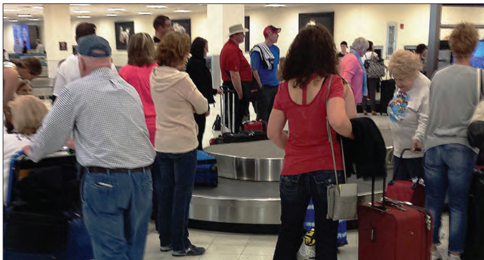
Above: Low profile flat-plate baggage claim carousels at Southwest Florida International Airport (RSW) allow easier retrieval of bags, particularly for aging travelers. Bags can be slid off the device to the floor rather than using a lifting motion as required for sloped plate baggage carousels installed at many airports.

RSW a more enjoyable experience for the “aging” traveler.