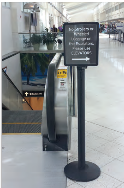
Above: Southwest Florida International Airport (RSW) added electronic signage (left) in its ticketing lobby to help guide passengers to the airline check-in area. Signs added to direct passengers away from escalators and toward elevators (right) help create a safer environment for aging travelers.