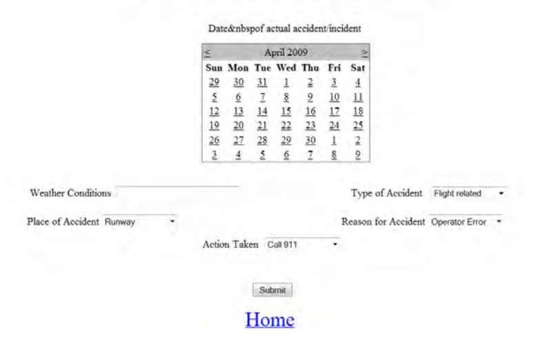
Figure 7: Accident Reporting Interface

Using the above interface, the user chooses from a set of standard characteristics of the event, including the date, type, and location of the event. A pre-determined selection of choices was developed based on research with the airport, who suggested standard classifications, primarily for analytical purposes. Upon submitting this basic information, the user then has the opportunity to enter a text-based description of the event.