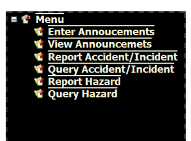
Figure 3: Home page of SMS data informationsystem

The "back end" of this system, which consists of a database for recording safety-related incident, hazards, and announcements, and a "selective query language" for retrieving and analyzing data was created using two popular programming platforms, SQL Server and Microsoft MS Access . The code created for this application may be found in Appendix G-2.