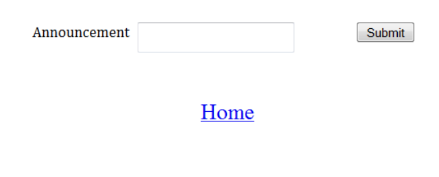
Figure 9: Announcement Posting Interface