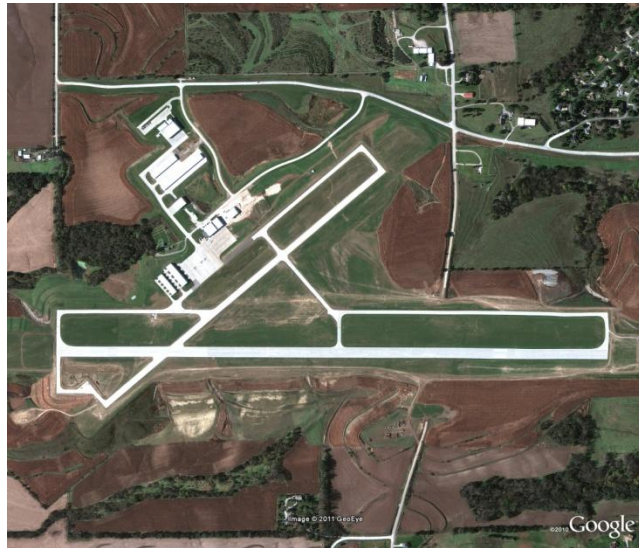
Council Bluffs Municipal Airport

tall. It will be placed in an elevated position at the Council Bluffs Airport (KCBF) in Council Bluffs, IA. For short range (0.125-0.15 nautical miles) the pulse repetition rate is .08 microseconds/ 2100 hertz. The medium range (1.5-3 nm) repetition rate is .3 microseconds/ 1200 hertz. The long range (3-48 nm) repetition rate is .8 microseconds/600 hertz. The frequency range for the unit is 9410 MHz +/- 30MHz. The peak power is 4.0 kW.