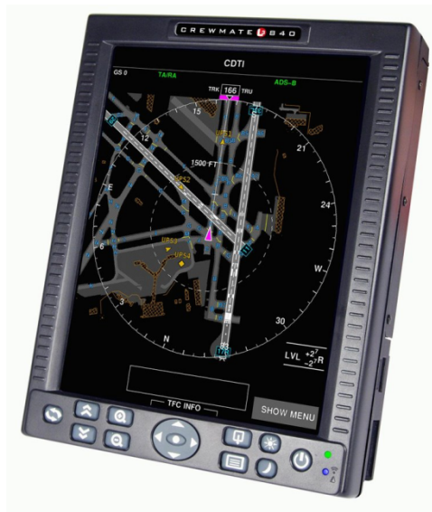
Figure 4.1: Potential ADS-B Cockpit Display (CDTI)

aircraft and use them in a “Cockpit Display of Traffic Information (CDTI) for increased situational awareness and collision avoidance practices.” (Hicok & Lee, 1998, p.F34-1)