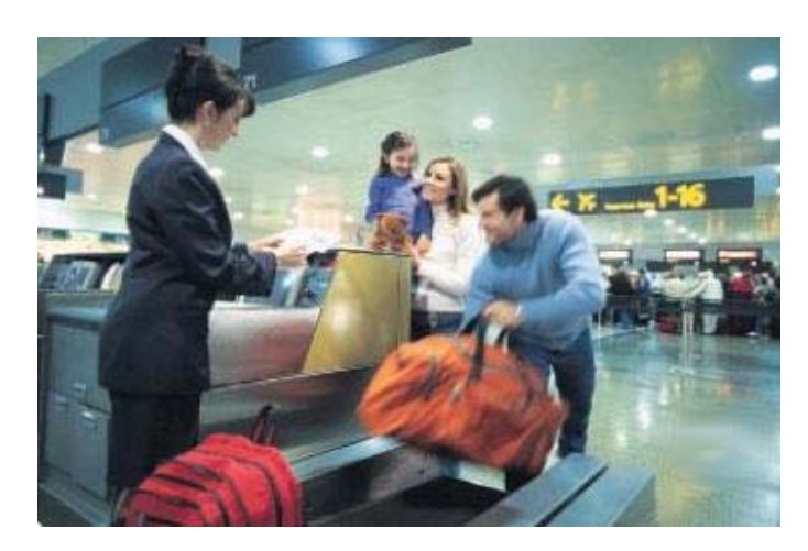
Figure 3 - Baggage check-in area where piezoelectric flooring could be implemented.

One such high traffic area is the check-in station, these areas often have large lines of passengers waiting to check in baggage and obtain boarding passes. Piezo devices could also be installed under the baggage weighing scales in the check-in areas to harness the energy from placing luggage on these platforms. Another high traffic area is the security line; the piezo devices could be located under the floors along these lines to capture the foot traffic in these lines. Concession areas and advertising signs would also benefit from having the power-generating floor. Billboards could be light up by people passing by and lighting in the concession areas could be partially powered by the flooring. Experimentation with different areas and by observing locations of high foot traffic in airport terminals are important in determining the optimal locations for capturing kinetic energy from walking.