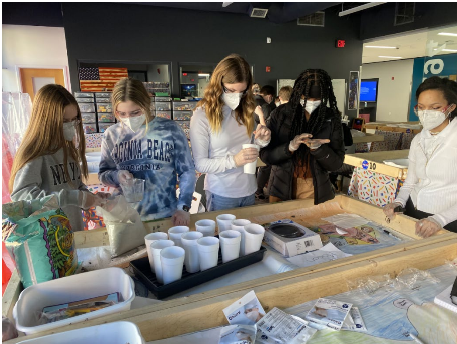
Photo 3 Caption: Students from Chesterfield Career and Technical Center in Chesterfield, Va. calculate plant growth measurements and monitor environmental conditions for their basil plants for the Plant the Moon Challenge.