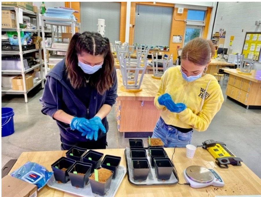
Photo 1 Caption: This Plant the Moon Challenge team grew radishes in lunar highland simulant in their high school science lab and varied the light source lumens and nutrient amendments in their experimental design.

The project's Plant the Moon Challenges will be offered in the spring semesters of 2023, 2024, and 2025. Many participants for spring 2023 have already been identified including, schools, school systems and informal organizations such as Boys and Girls Clubs, 4H and Future Farmers of America. The project has broad appeal to science, biology, botany, earth science, and agricultural learning among other disciplines. For more information, contact: vsgc@odu.edu .