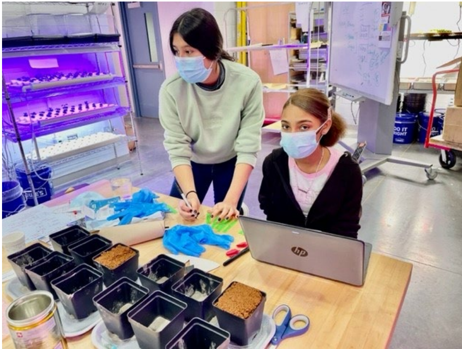
Photo 2 Caption: The experimental design for this high school Plant the Moon Challenge team included two separate trials conducted within the 8-week grow period to test the optimal lighting and soil amendment conditions for their radish crops grown in lunar highland regolith simulant.

Old Dominion University Peninsula Center, 600 Butler Farm Road, Suite 2200, Hampton, VA 23666, (757) 766-5210