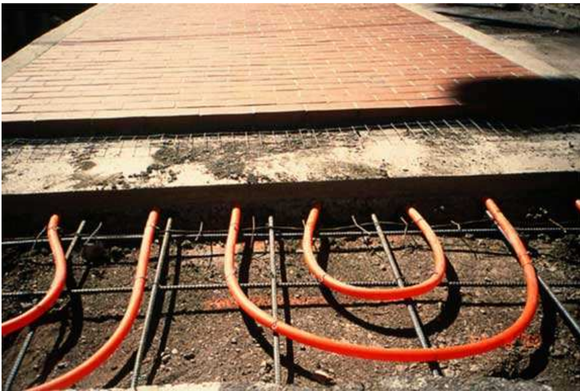
Figure 1 shows a geothermal loop system used to melt ice and snow from a sidewalk in Klamath Falls, Oregon. A similar system on a larger scale could be used to heat airport runways.